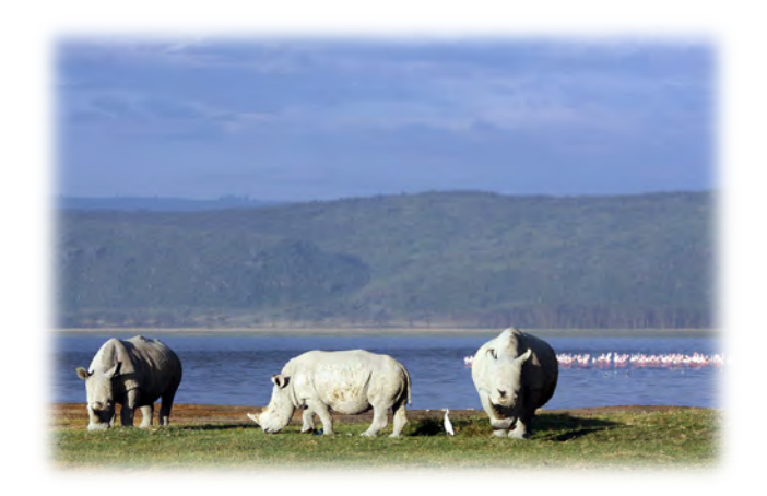
Day 3: A full day excursion to Lake Nakuru complete with a picnic breakfast/lunch. Return to the lodge for dinner and overnight. B,L,D

Loldia House offers a choice of accommodation either in the old family house or in cottages in the grounds. In the main house, there is one en-suite double room. Close by are three other guest cottages (each housing two separate rooms, all en-suite), surrounded by pretty gardens and offering incredible views across the lake to the extinct volcano, Mount Longonot. Up on the hill is the specially built Top Cottage, which has three double bedrooms and its own sitting room with an open log fire, making it ideal for families or close friends travelling together. The vista from up here is stupendous! Wi-Fi is available in the main areas.