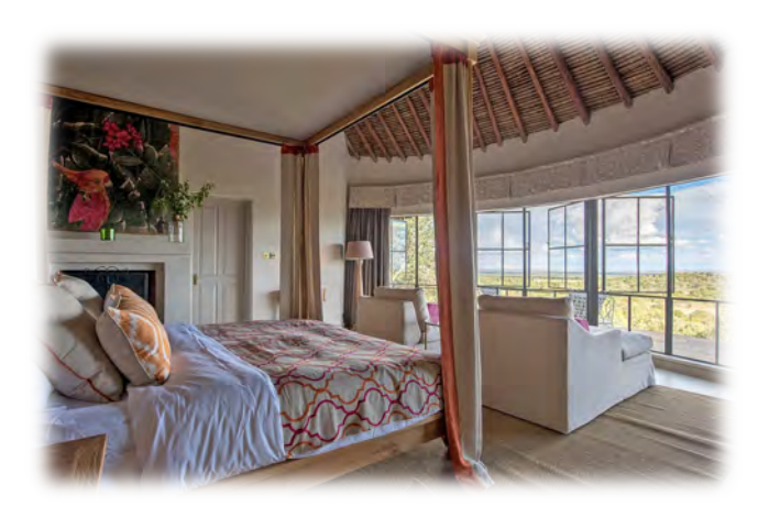
Day 5: A full day to explore the Mugie Conservancy. Securing land for wildlife is a key conservation imperative in Africa today and Mugie Conservancy provides a key wildlife access route between the Laikipia plateau, the Mathews Range and the Samburu lands to the north and east.

Perched on a hill are eight stone cottages, each with sweeping views of the Laikipia landscape. A large main house with open log fires will host guests for relaxing cocktails and scrumptious meals, prepared from a creative menu with ingredients sourced from our own vegetable garden. An infinity pool offers lovely, shaded areas and a casual alfresco dining area, while a waterhole set in front of Mugie House attracts a variety of wildlife with a hide to offer some close encounters Wi-Fi is available in the cottages and main areas.