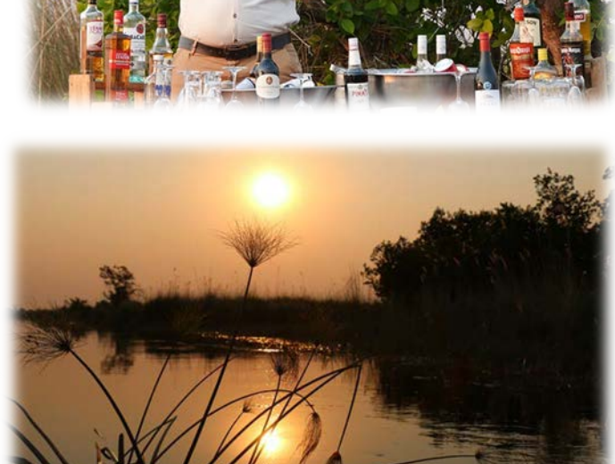
September 19 & 20 : Full days at the camp enjoying amazing wildlife by foot & boat! B,L,D

experienced professional guides who will expertly navigate guests through the many meandering, reed-lined waterways. Roam the vast expanses of water from the comfort of a modern motorboat or explore the intricacies of the Okavango Delta the quiet old-fashioned way, in the traditional mokoro (dugout canoe). For those wanting to get a little closer to nature, guided bush walks are conducted on a number of the nearby islands, offering an opportunity to track some of the larger land-based species that inhabit this water wilderness. Birding opportunities are outstanding, and anglers may put their skill against bream and tiger fish. Camp Okavango is a water-based camp and game-drive activities, using safari vehicles, are not possible.