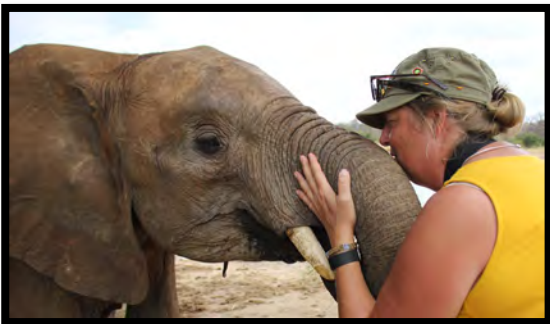
Sheldrick Wildlife Trust Ithumba Reintegration Site, Tsavo NP Kenya