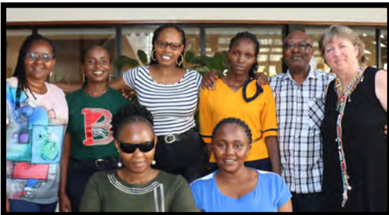
March 2022 - Celebrating the first (but not the last!) 5 University Grads that started in the Bride Rescue Program at Kajiado Girls School years ago. How proud we are of these young ladies!