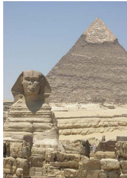
The Giza pyramids and sphinx monument

The Valley of the Kings and queens and the tomb of King Tutankhamun. This area is traveled by luxury river boat cruises. See our web site or call for more in formation on this new exciting African destination. Our next group departure is May 2007!